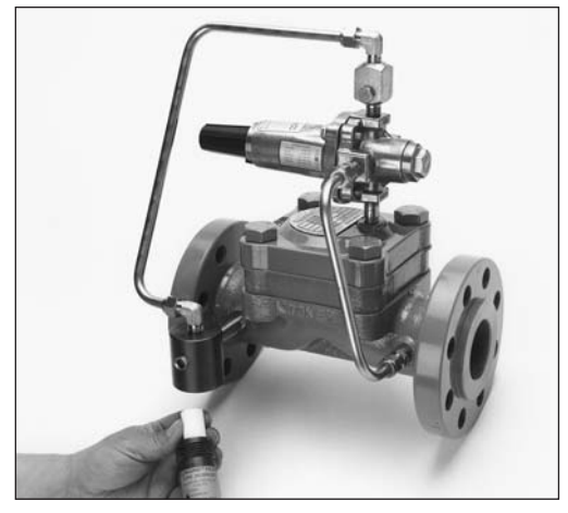
Figure 1 - The Type 30A Mooney® Filter with Filter Housing removed allowing easy inspection of the element. Mounted on a 2" large single Port Flowgrid® Regulator with Series 20 Pilot and Type 24 Restrictor.

Personal injury, equipment damage, or leakage due to explosion of accumulated gas or bursting of pressure containing parts may result if this FILTER is overpressured or is installed where service conditions could exceed the limits given in the specification of this manual or on the nameplate, or where conditions exceed any ratings of the adjacent piping or piping connections. Verify the limitations of both valve and pilot to ensure neither device is overpressured. To avoid such injury or damage, provide pressure relieving or pressure limiting devices (as required by the Title 49. Part 192. of the U.S. code of Federal Regulations, by the National Fire Codes of the National Fire Protection Association, or by other applicable codes) to prevent service conditions from exceeding those limits. Additionally, physical damage to the valve/regulator, codes break the pilot or filter off the main valve, causing personal injury and/or property damage due to explosion of accumulated gas. To avoid injury and damage, install the filter in a safe location.